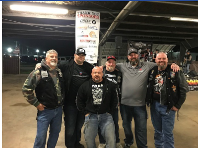
Iron Order Motorcycle Club BBQ Event